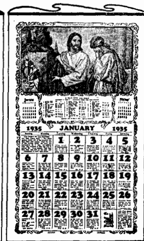
Single copy, 30c; 4, $1.00; 12, $3.00; 25, $5.75; 50, $9.00. All prices slightly higher in Canada.