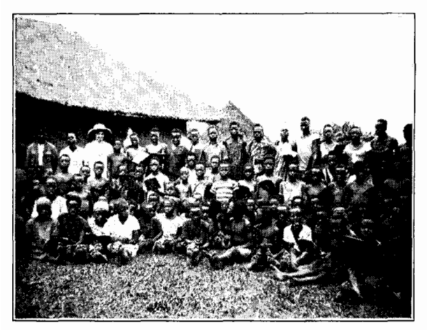
A school in a heathen town in Liberia

One day some men came to my station; they told me the paramount king of their town had sent them to come and carry me over to preach